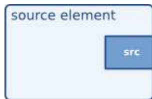
Figure 5-1. Visualisation of a source element

Source elements do not accept data, they only generate data. You can see this in the figure because it only has a source pad (on the right). A source pad can only generate data.